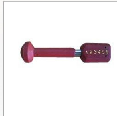
Container Bullet Seal