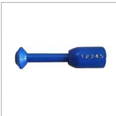
Container Bottle Seal