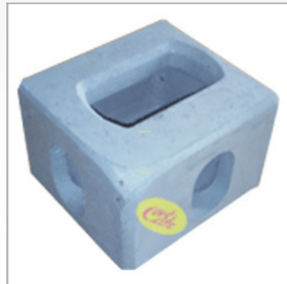
ISO Corner Casting