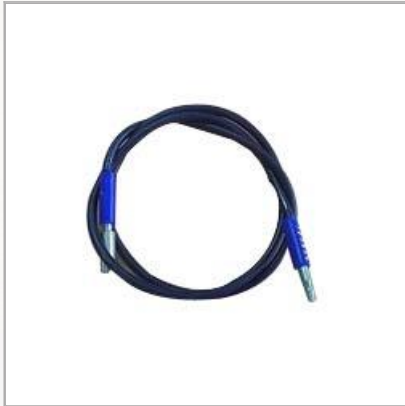
Fabricated Cable Seals