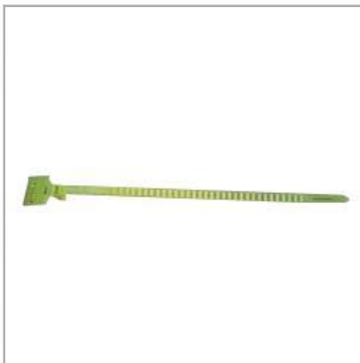
PTF Security Seals