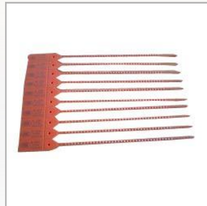
PTM(r) Plastic Sealers