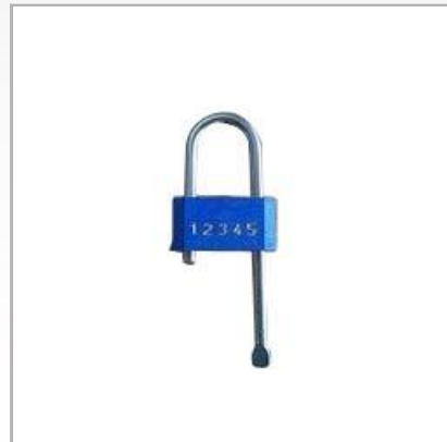
Security Padlock Seals