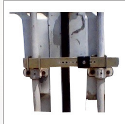
S - Eye Barrier Seals