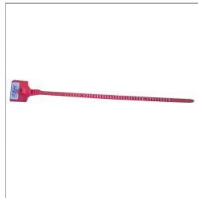
PTM Plastic Security Seals