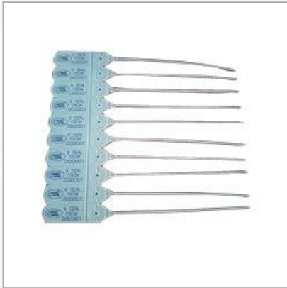
PTX Plastic Security Seals