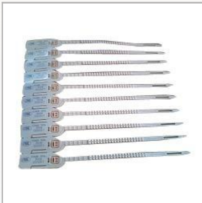
PTC Plastic Seals

Excellent range of plastic seals is provided by us for high security sealing. We provide qualitative range of plastic seals with the help of our diligent workforce and strict product testing team who check the product at each level for quality. Our range is made in accordance with all accepted industry norms and standards.