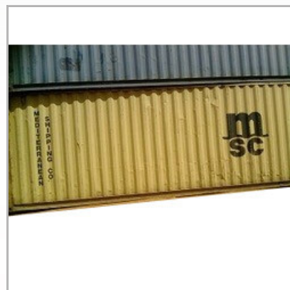
Shipping Containers Homes