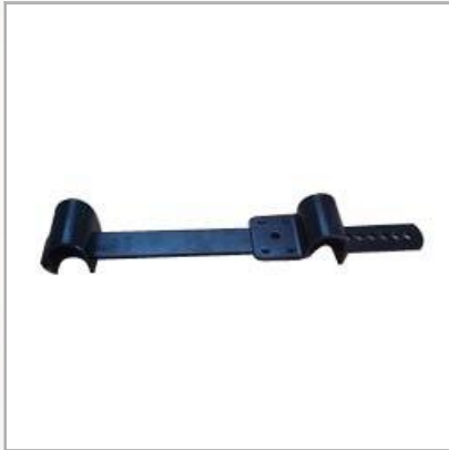
H - Eye Barrier Seals