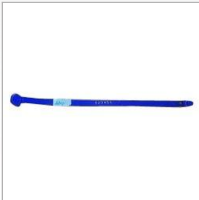
Plastic Seals & Strip