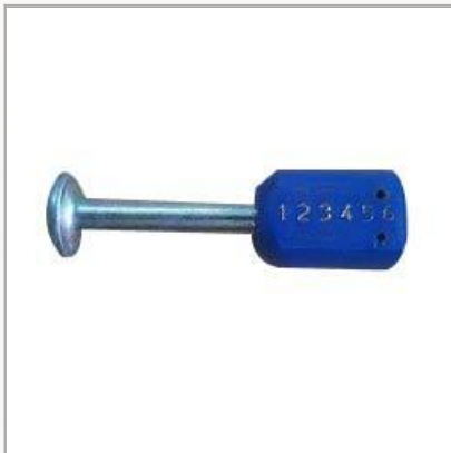
Container Security Seal

Lots of buyers are approaching us for our premium range of container seals. We use high grade material and state of the art technology for manufacturing a wide range in different shapes, sizes and color combinations. These high performance container seals are recommended for their one time lock (OTL) feature.