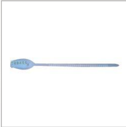
PTS Security Seals