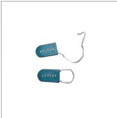
Industrial Padlock Seals