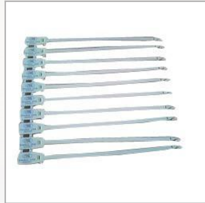
SafeStrip-M Plastic Seals