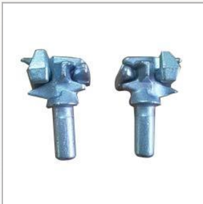
Cam & Keeper

Precision engineered container parts are designed for industry specific applications. Our range of container parts are available in custom finish design & pattern. This product range is highly popular among the clients for its superior quality, higher functionality and longer term of service. We offer this range at acceptable prices to our domestic clients.